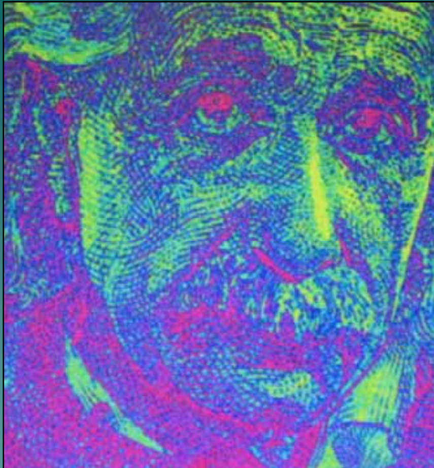
Albert Einstein Immigrant and Princeton University Professor