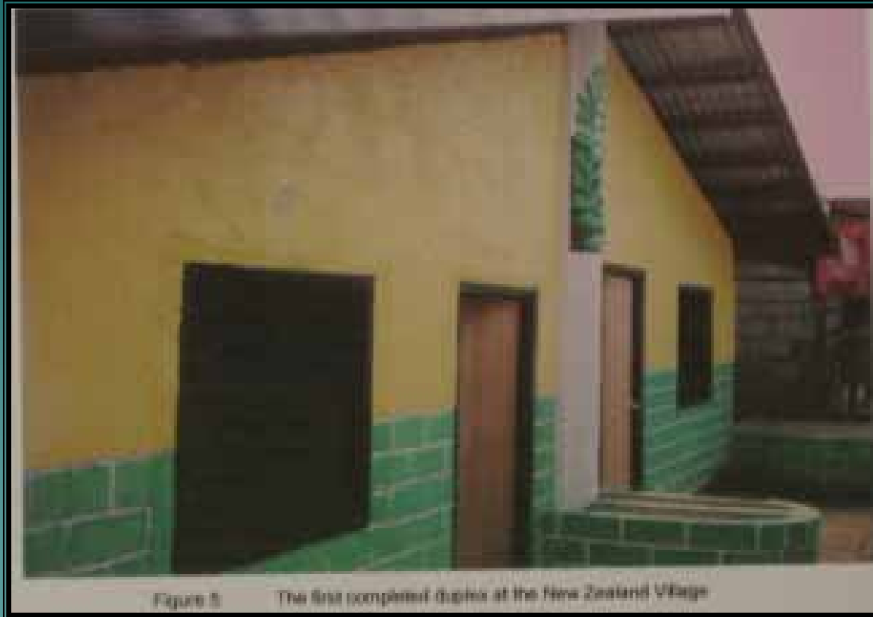
Figure 5 The first completed duplex at the New Zealand Village