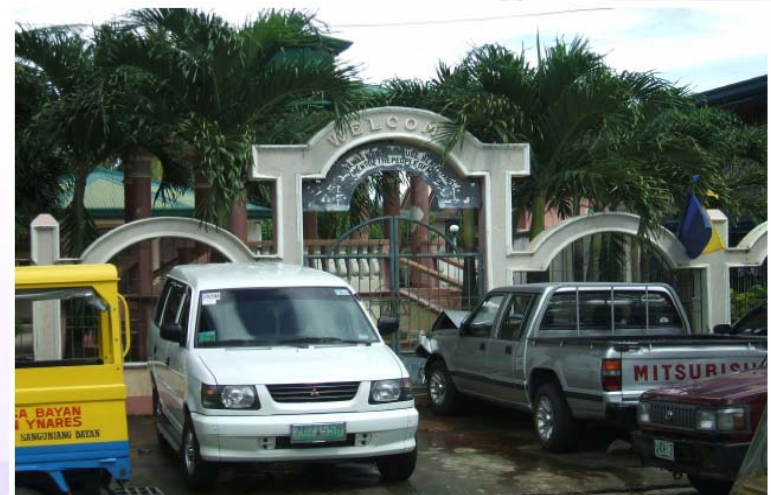
Entrance to Balikbayan Park, Morong