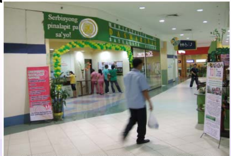
Dasmarinas Satellite Office beside OFW Pamilya Center at Robinsons Place Dasmarinas