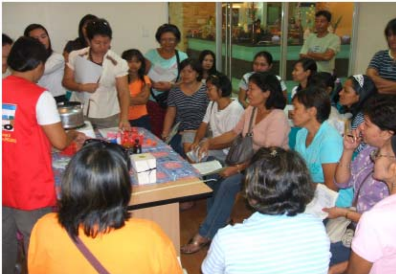
A livelihood seminar being conducted at the OFW Pamilya Center at Robinsons Place Dasmarinas