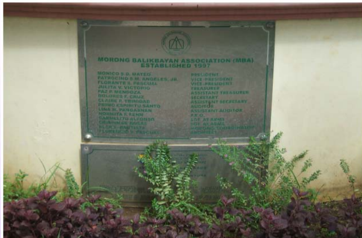
Morong Balikbayan Association Marker, Morong